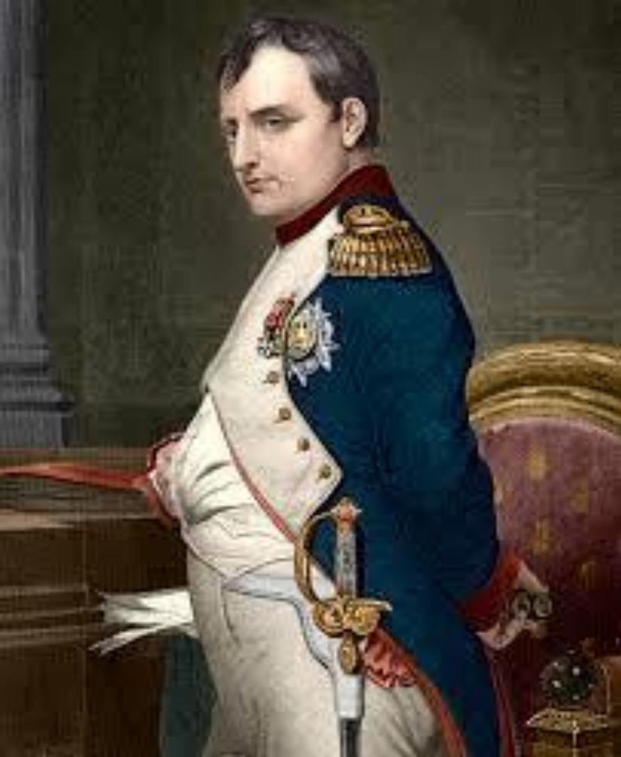
Napoleon Bonaparte (1769-1821)